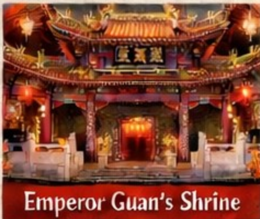
Emperor Guan's Shrine