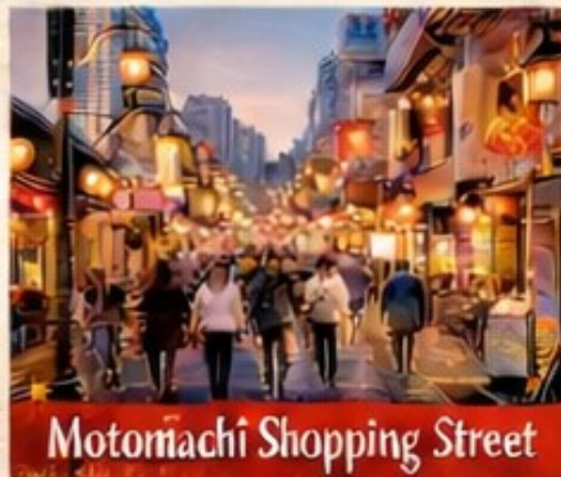
Motomachi Shopping Street