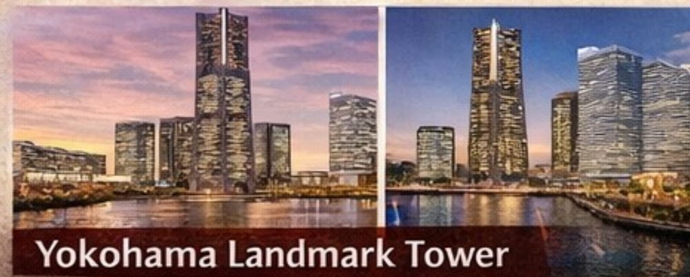
Yokohama Landmark Tower