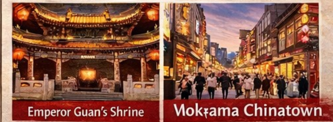
Emperor Guan's Shrine