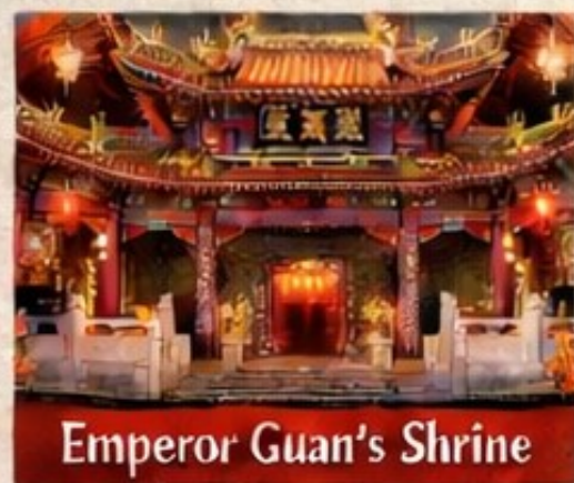
Emperor Guan's Shrine