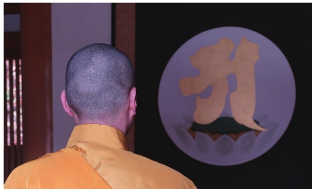
Ajikan, Shingon Buddhism Meditation

FEATURE This is an unguided plan allowing you to explore World Heritage Site Koyasan on your own. At the accommodation, a temple lodging in Koyasan, customers can experience a religious service in the morning.